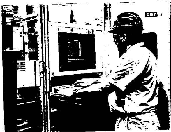
Figure 2: installed system in the Entsorgungsbetriebe Simmering